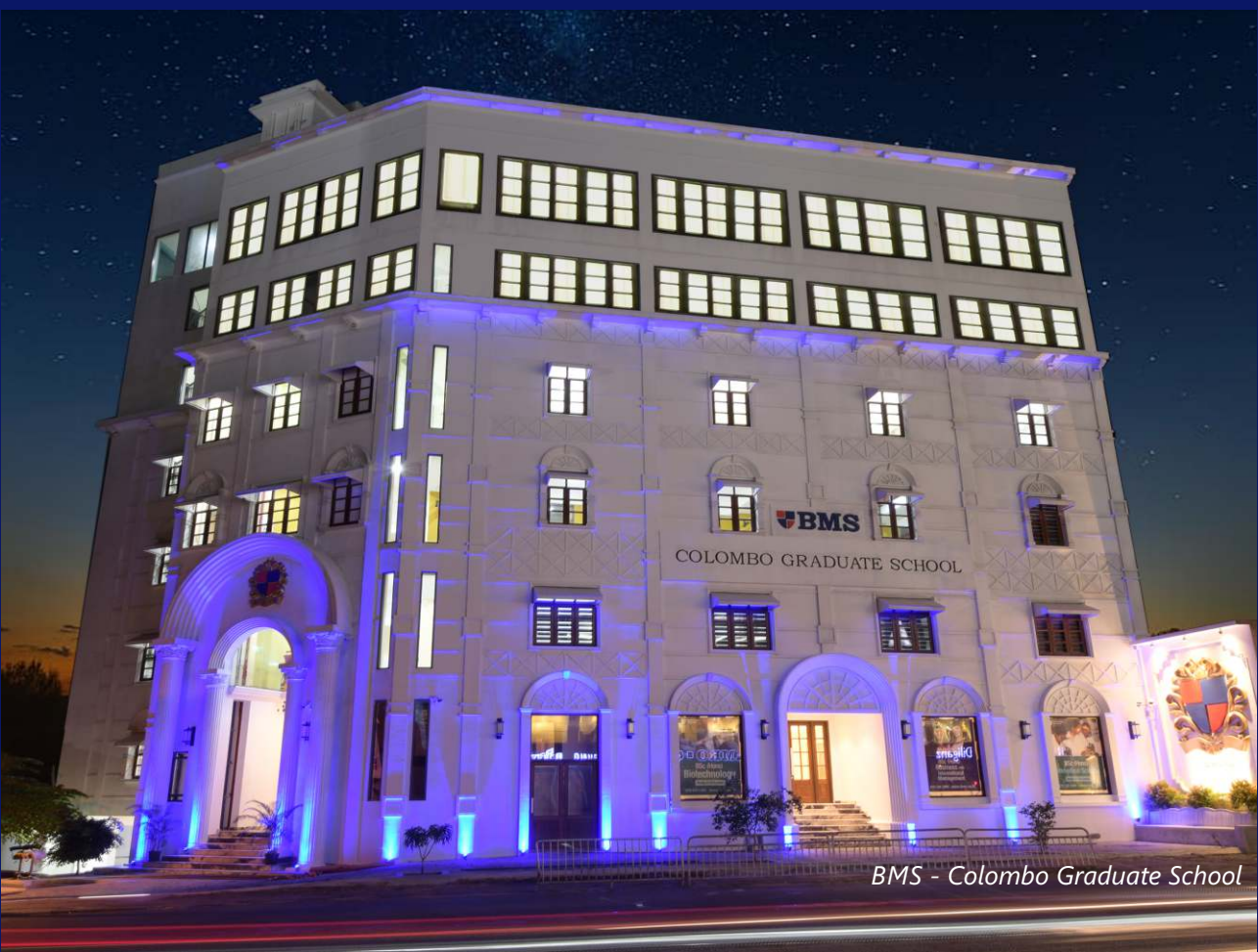
BMS - Colombo Graduate School